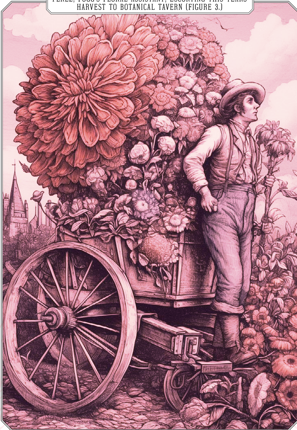
PEREZ, FOGG'S FLORAL ASSISTANT, ESCORTING THIS YEAR'S HARVEST TO BOTANICAL TAVERN (FIGURE 3.)